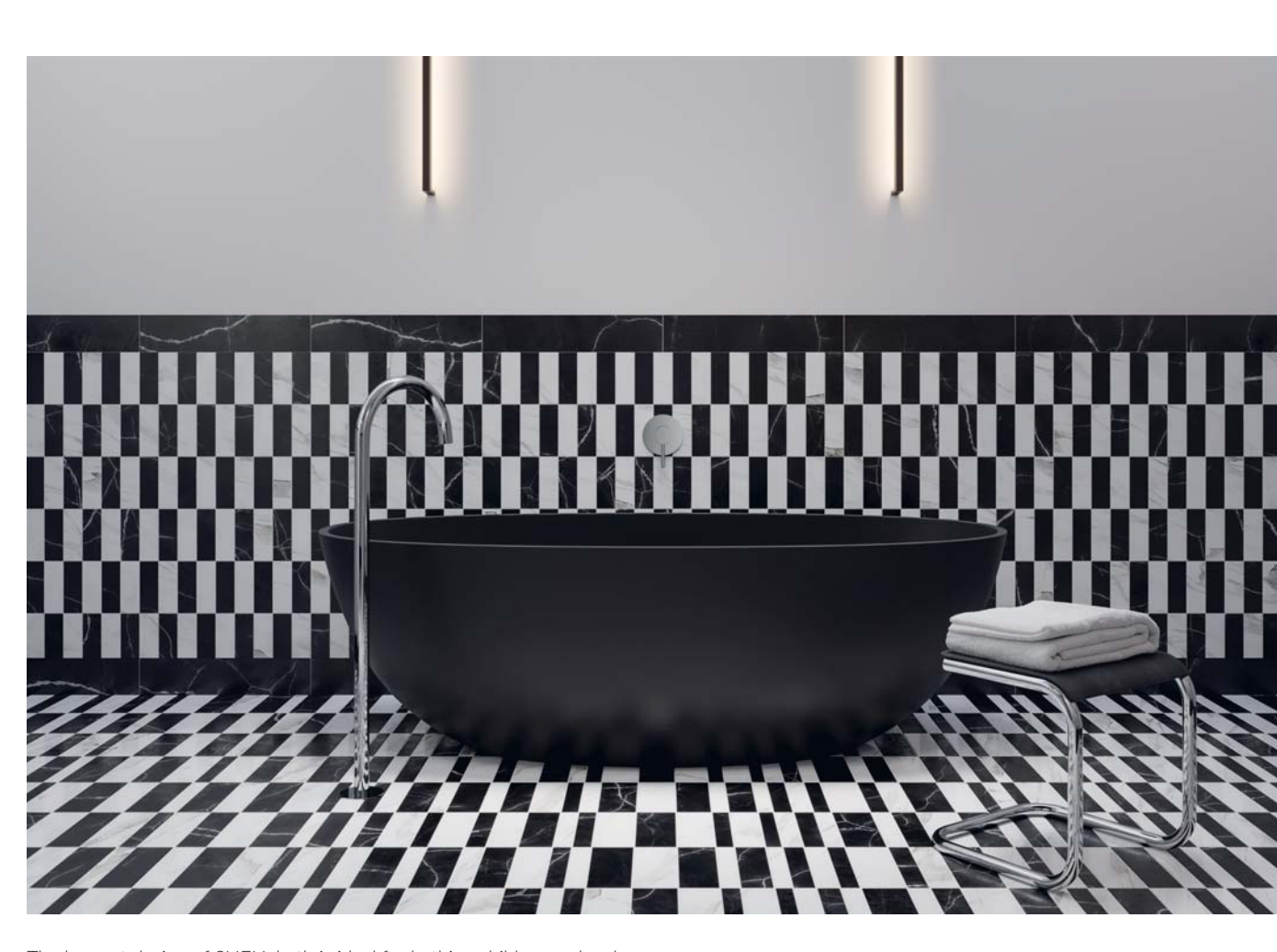
The low-set design of SHELL bath is ideal for bathing children and makes getting in and out much easier, while still offering an optimal depth for an indulgent, soothing experience.