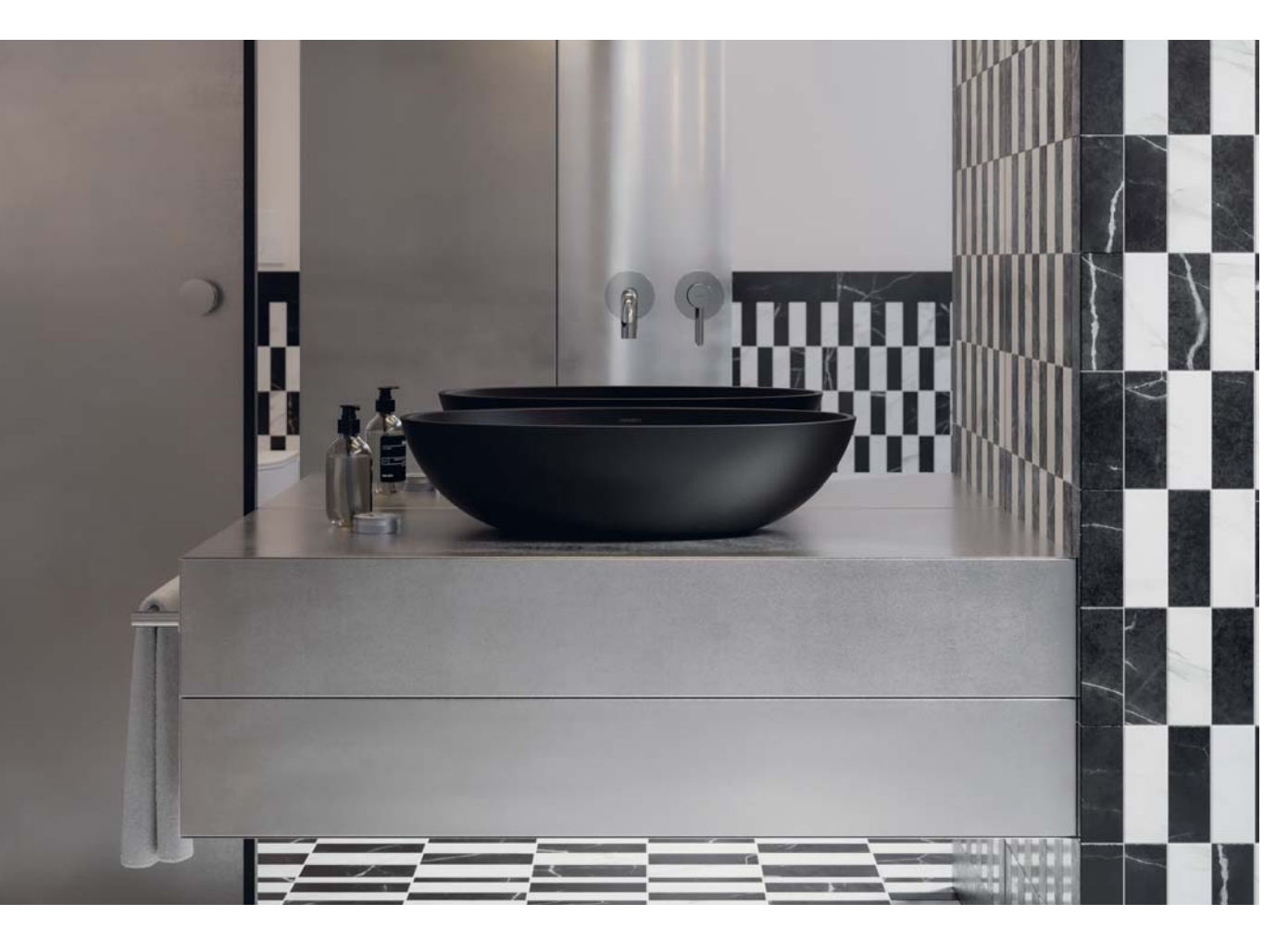
The minimalist shapes have a lightweight yet solid look, creating an effect of monoliths carved from rock. The skilfully contoured silhouette, meticulously finished edges and a matching waste cover create a form of ideal proportions and contemporary character.

"When designing the SHELL collection, we were keen to find ideal proportions and introduce subtle, harmonious lines. Our aim was to create a sculpted form for the bathroom space that would also be incredibly comfortable to use".