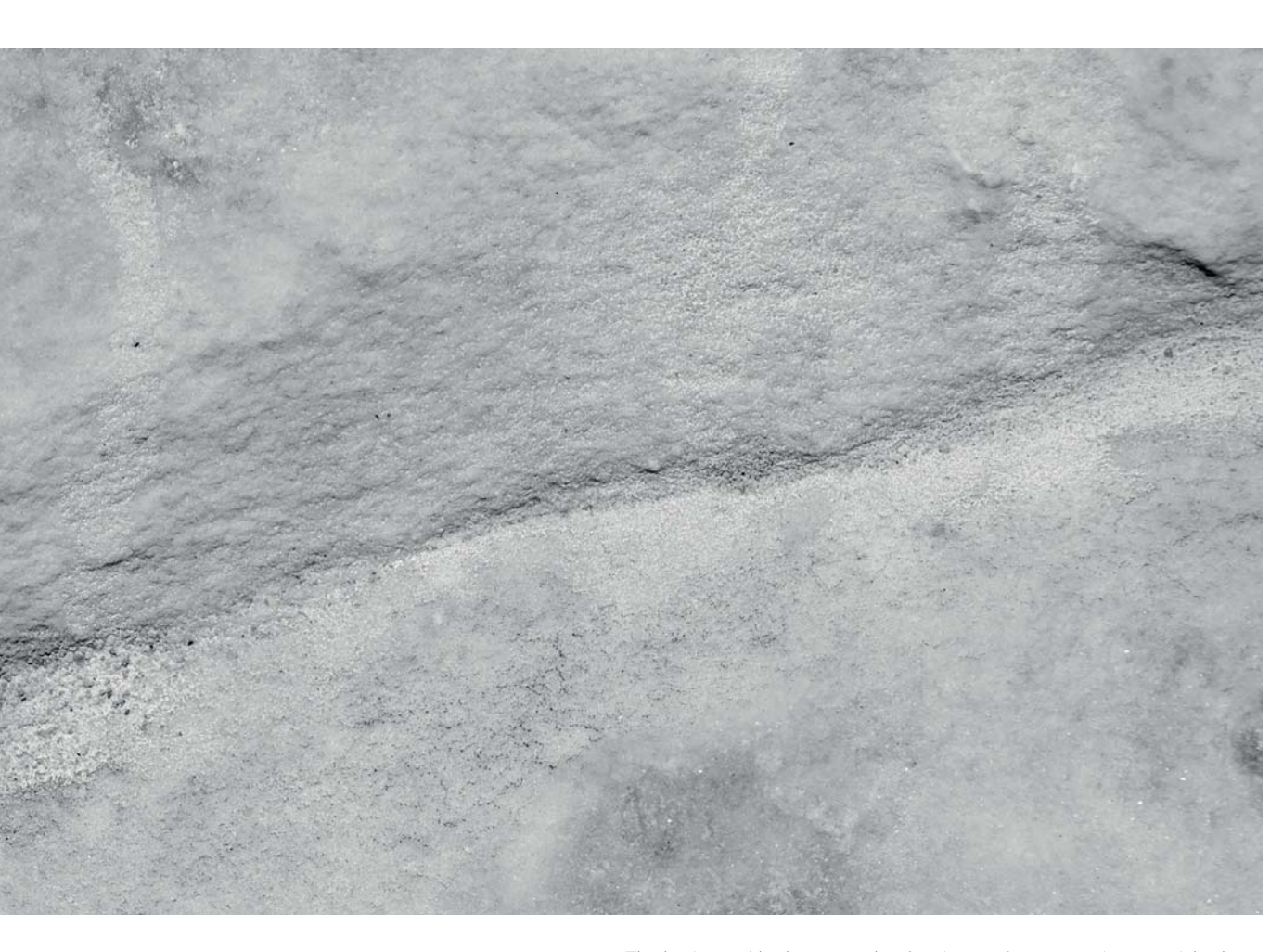
The basins and baths are made of an innovative composite material, whose main component is Polish dolomite rock. The advanced production technology guarantees flawless execution of every detail while ensuring remarkable durability.

The composite material absorbs heat from the air and water, maintaining the optimum temperature for a long time, which, combined with a surface that is smooth and pleasant to the touch, ensures unparalleled comfort of use.