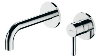
Basin mixer Y1215H#