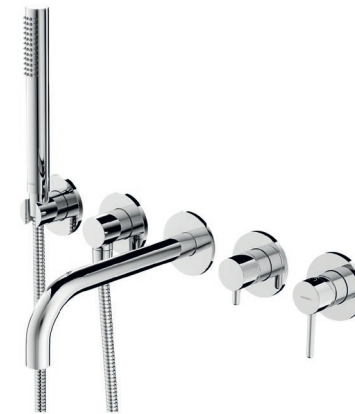
5-hole bath mixer with long spout Y1237-1#