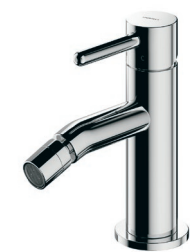
Bidet mixer Y1220#