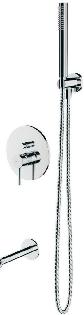
Bath system SYSYW01#