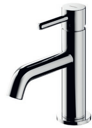
Basin mixer Y1210N#