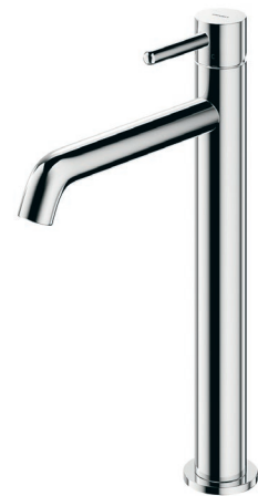
Tall basin mixer Y1212#