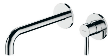
Basin mixer with long spout Y1215HL#