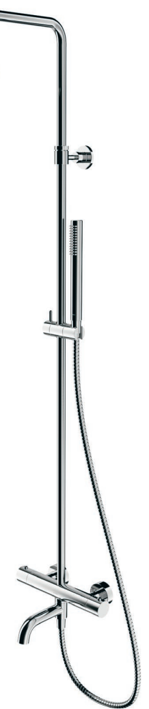
Shower system SYSY22X# SYSY35# SYSY19# SYSY18# SYSY16#