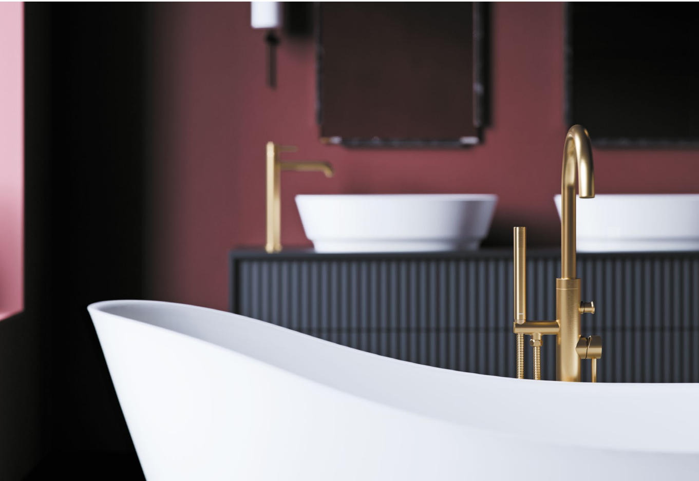
The basins and baths are made of an innovative composite material whose main component is Polish dolomite rock. The production technology guarantees impeccable execution of every detail while ensuring remarkable durability.

The composite material absorbs heat from the air and water, maintaining the optimum temperature for a long time, which, combined with a surface that is smooth and pleasant to the touch, ensures unparalleled comfort of use.