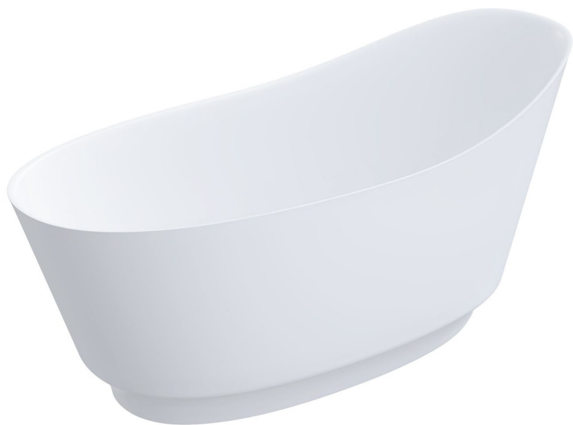
High back freestanding bath, 158 x 72 cm NEO158SWWBP gloss white NEO158SWWBM matt white