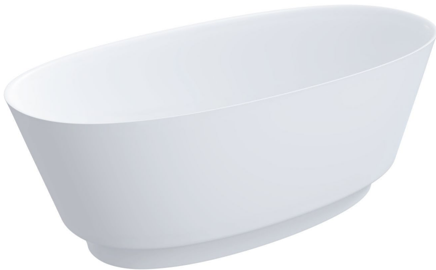
Freestanding bath, 158 x 72 cm NEO158WWBP gloss white NEO158WWBM matt white